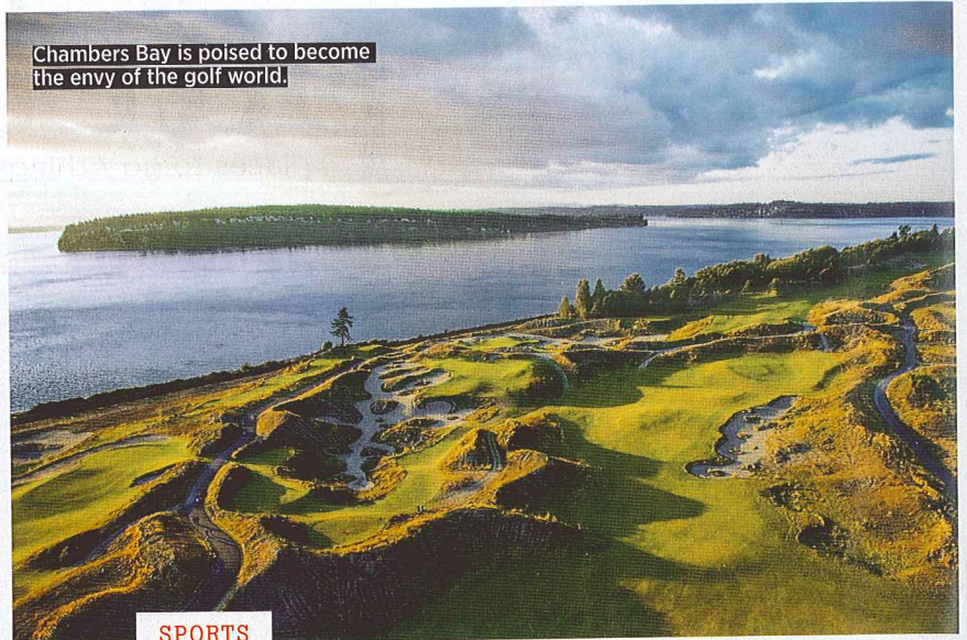
Chambers Bay is poised to become the envy of the golf world.